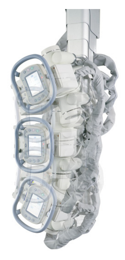
Figure 4: Overhead Suspension demonstrating single series VolumeRAD sweep