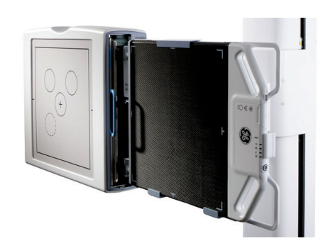
Figure 6: Motorized Tilting Wallstand