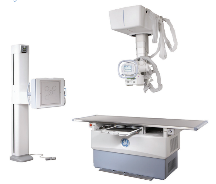
Figure 1: Discovery XR656 Table and Wallstand system.

A full range of accessories is also available, such as; mobile stretchers, weight bearing exam tools, patient table accessories and grids.