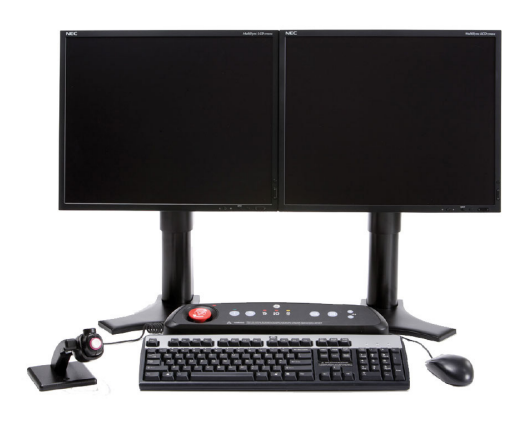
Figure 3: Acquisition workstation with 2 flat panel monitors to minimize desktop space required.

The Acquisition Workstation is the primary interface to the network and provides image post-processing capabilities. The System Controller Module provides single point control, directing and coordinating overall system operation, while monitoring all system modules automatically through software.