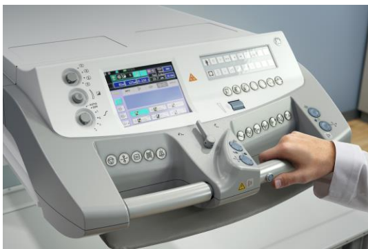
Image can also be positioned using the FPD tower. A power-assisted handle is available to help easily position the tower in all three dimensions. An additional handle is also available as a positioning guide.